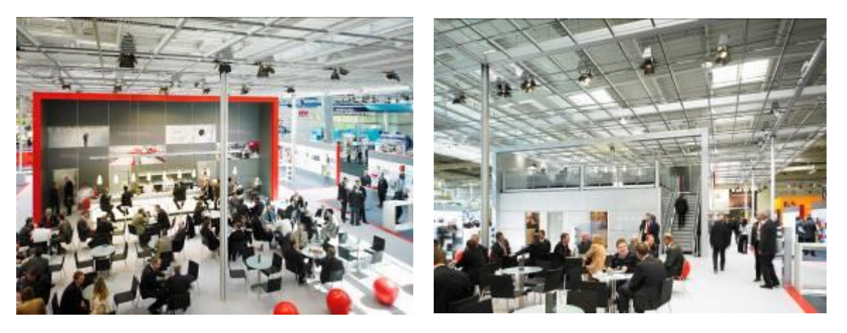
Photo: SEW-EURODRIVE trade show booth, HMI 2009, idea & execution by Expotechnik Group

Thanks to the use of Expotechnik's "Titanium" superstructure concept, the entire presentation appears to be a three-dimensional installation within a three-dimensional space. The system serves as additional framework holding together the individual elements as a whole. "Titanium superstructure system has been developed especially for large-scale superstructures. It allows for beam spans of up to twelve meters at a height of up to seven meters. Being the first company to benefit from the new system, SEW-EURODRIVE also was the only company utilizing it at this year's Hanover Messe Industry. With the project for SEW, this product innovation was launched in the market," explains Alexander D. Soschinski, Managing Partner of the Expotechnik Group.